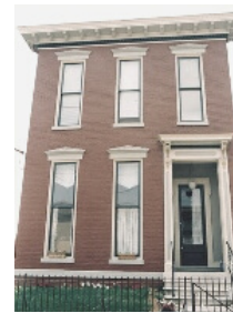
Samuel B. Todd Center

Wellspring serves individuals age 18 or older who are experiencing acute psychiatric distress but who are otherwise medically stable. All admissions are on a voluntary basis.