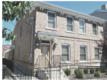
David J. Block Center

There are 16 beds between Wellspring's Two Crisis Stabilization Program Properties.